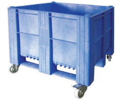
Corner pattern. The bin cannot be stacked