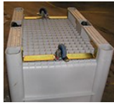
Diamond pattern. The bin can be stacked